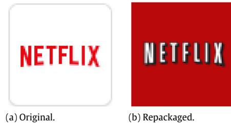
Fig. 2. Netflix app icons. (For interpretation of the references to colour in this figure legend, the reader is referred to the web version of this article.)